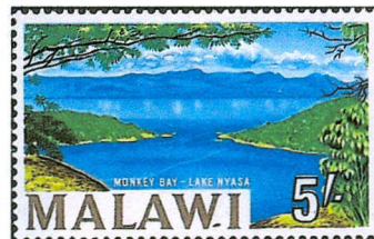
MALAWI (Scott #26)