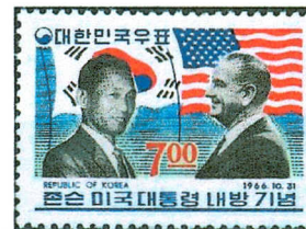
KOREA (Scott #544)