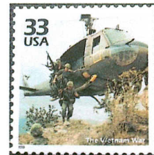
USA (Scott #3188g)